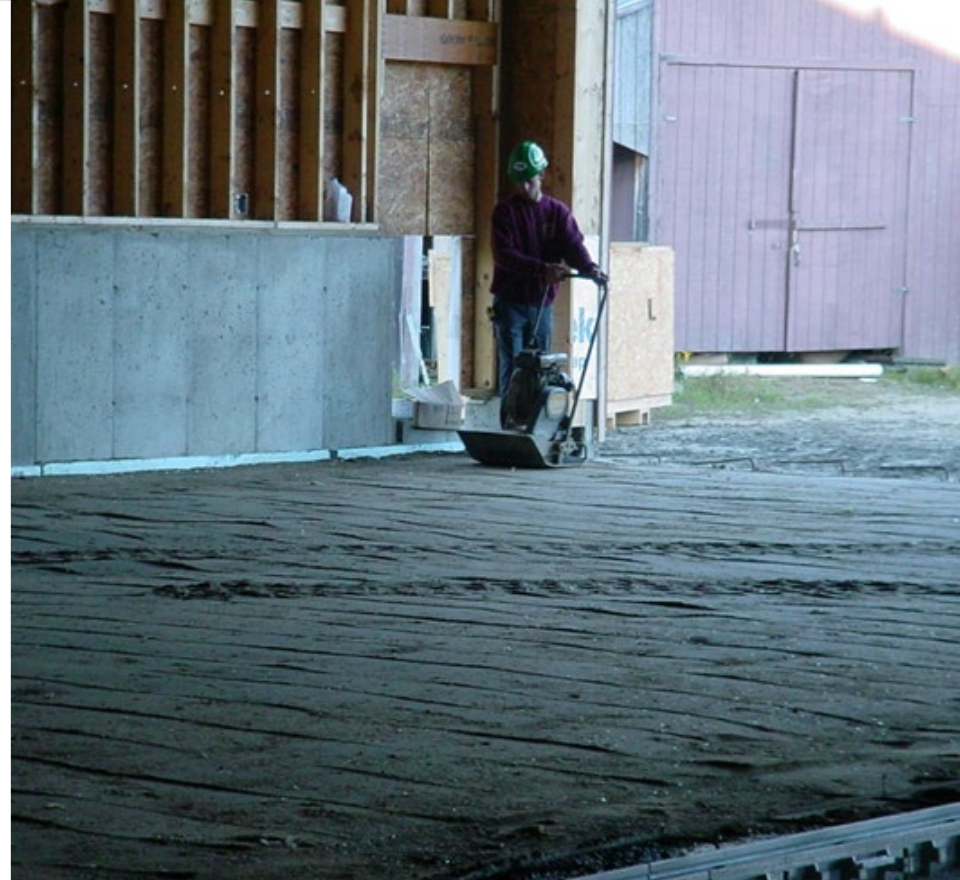
Public Works Garage Floor Sub-base