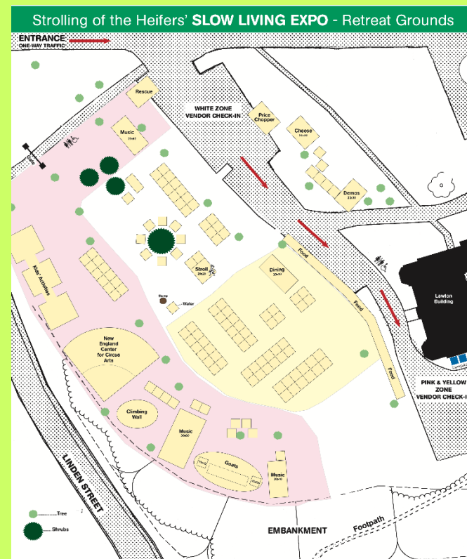
Strolling of the Heifers, Brattleboro, VT