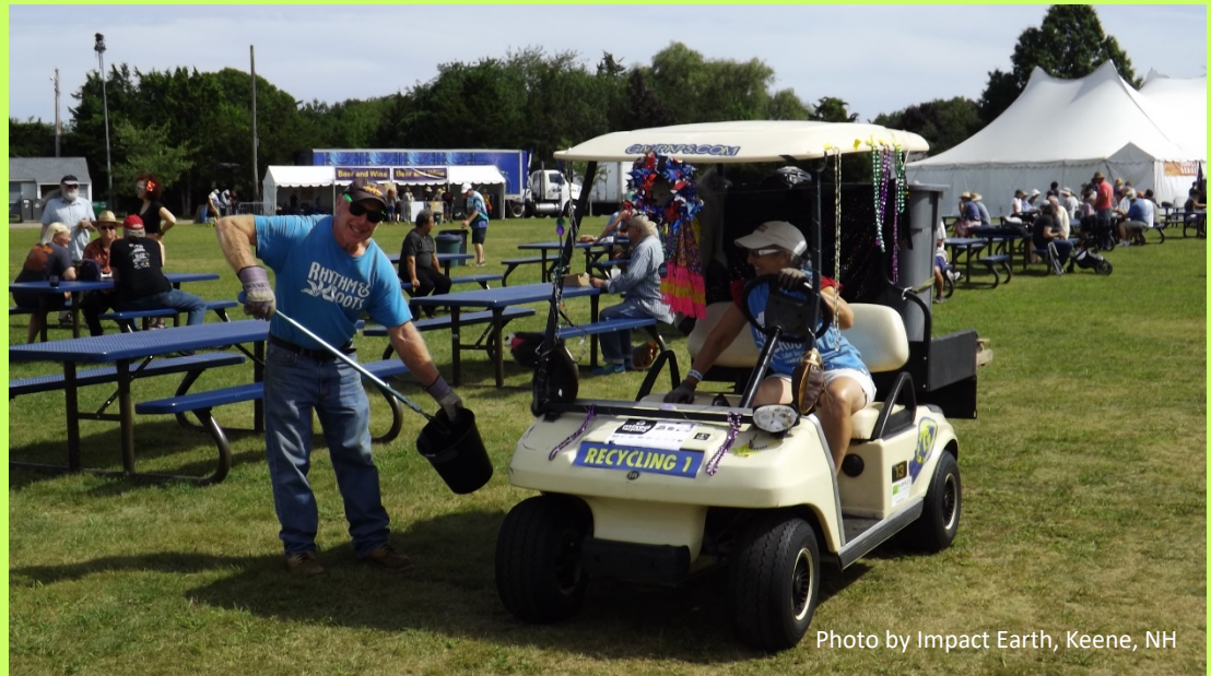
Rhythm & Roots, Charlestown, RI, 2019