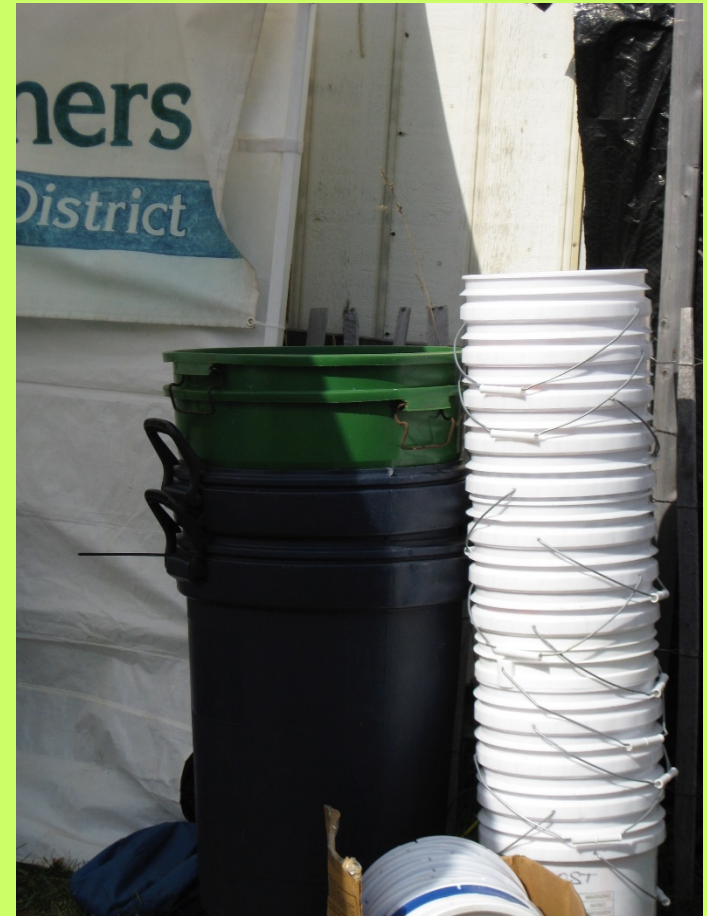
Franklin County Solid Waste District, Greenfield, MA