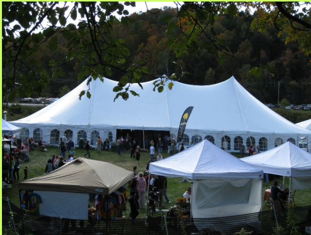
Wine Festival, Wilmington, VT